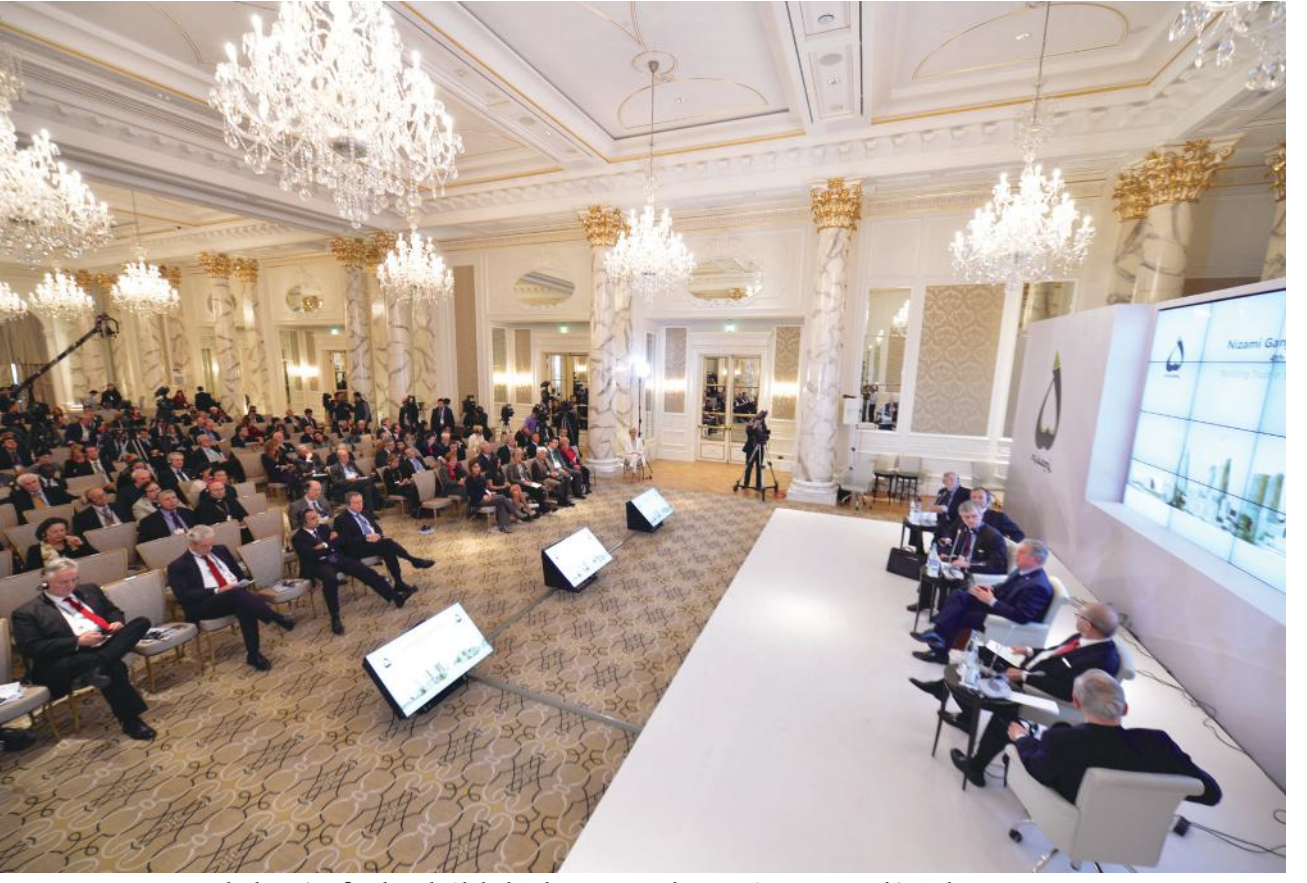
The location for the 4th Global Baku Forum – The Four Seasons Hotel in Baku.

The Global Baku Forum was divided into two main parts. Firstly, present leaders spoke about the global challenges of today's world; from there on, four plenary panels and six parallel panels assessed the most pressing cases, beginning with Syria, Ukraine, Iran and Afghanistan, and continuing with thematic issues: radicalisation and migration; energy security; global inequality; human rights and women's empowerment; interfaith dialogue; and multiculturalism and integration. A group of "Young Leaders" also presented their view on the current state of the world and potential solutions to key challenges in a plenary session.