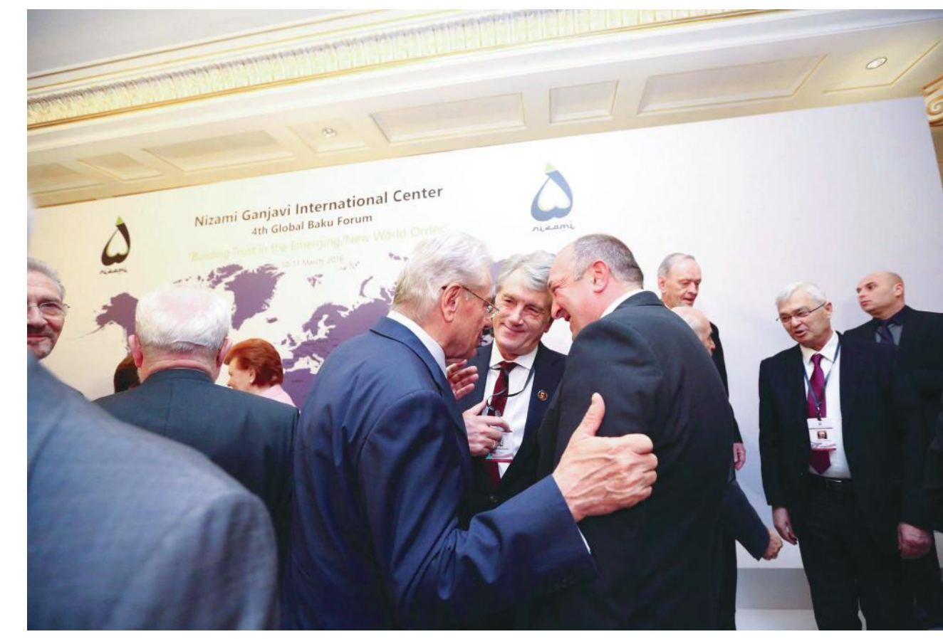
The delegates discuss pressing global issues.

"Europe has been absent, not only reluctant, from contributing to solving Syria's crisis from the origin. What is at stake is the traditional, European soft power, of which we used to be so proud, and which has completely failed in addressing Syria's war and managing the migrant flows strategically." Franco Frattini