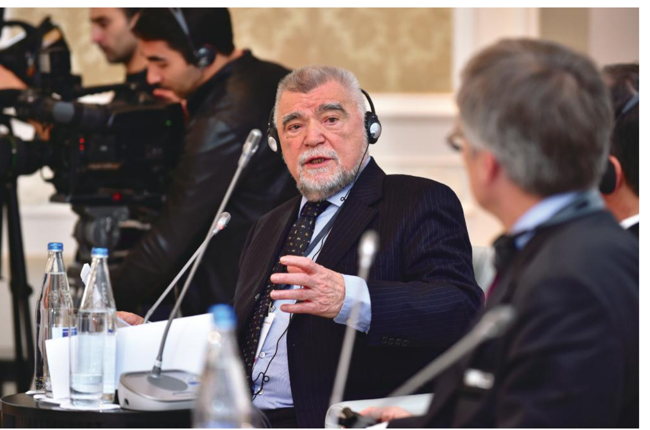
Stjepan Mesic, former President of Croatia, discusses the Syria crisis.

"We still haven't learned that democracy cannot simply be imported. We continue trying to bring democracy from the outside when there is no press freedom, no NGOs, no rule of law. It is simply not possible to build democracy overnight." Hikmet Cetin