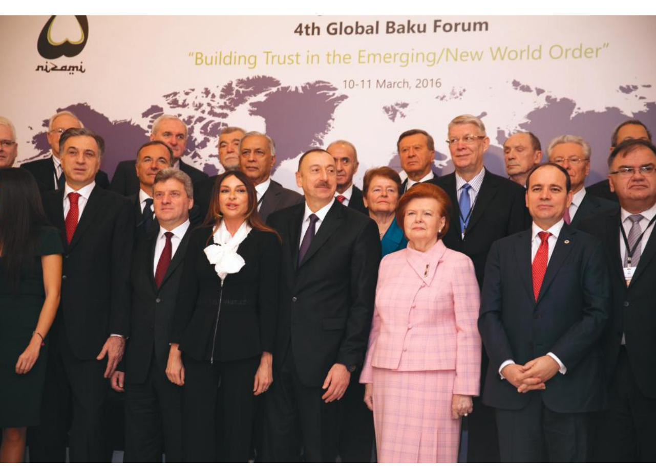
The "family photo" of the 4th Global Baku Forum.