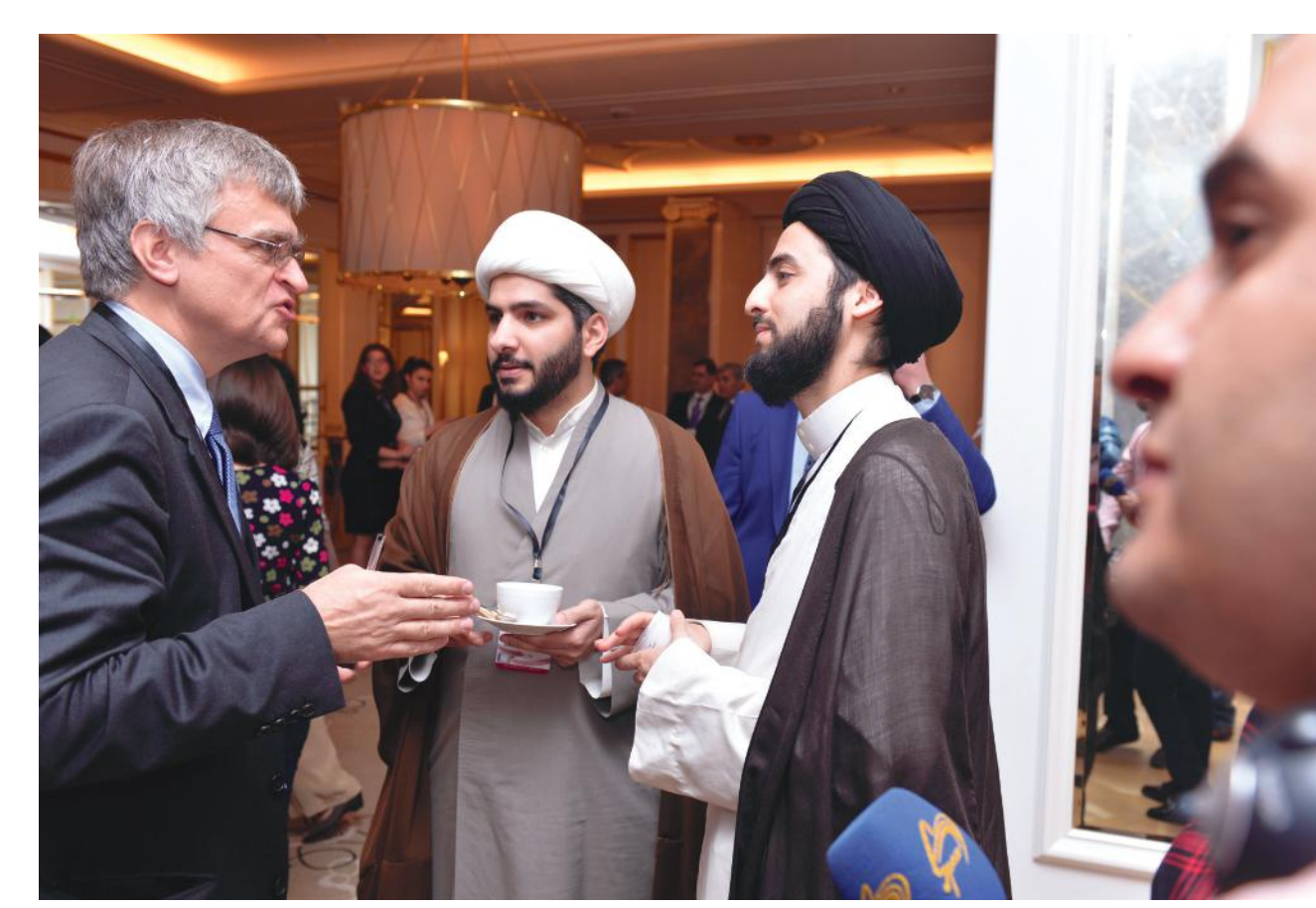
High-level delegates from across the world came together in Baku.