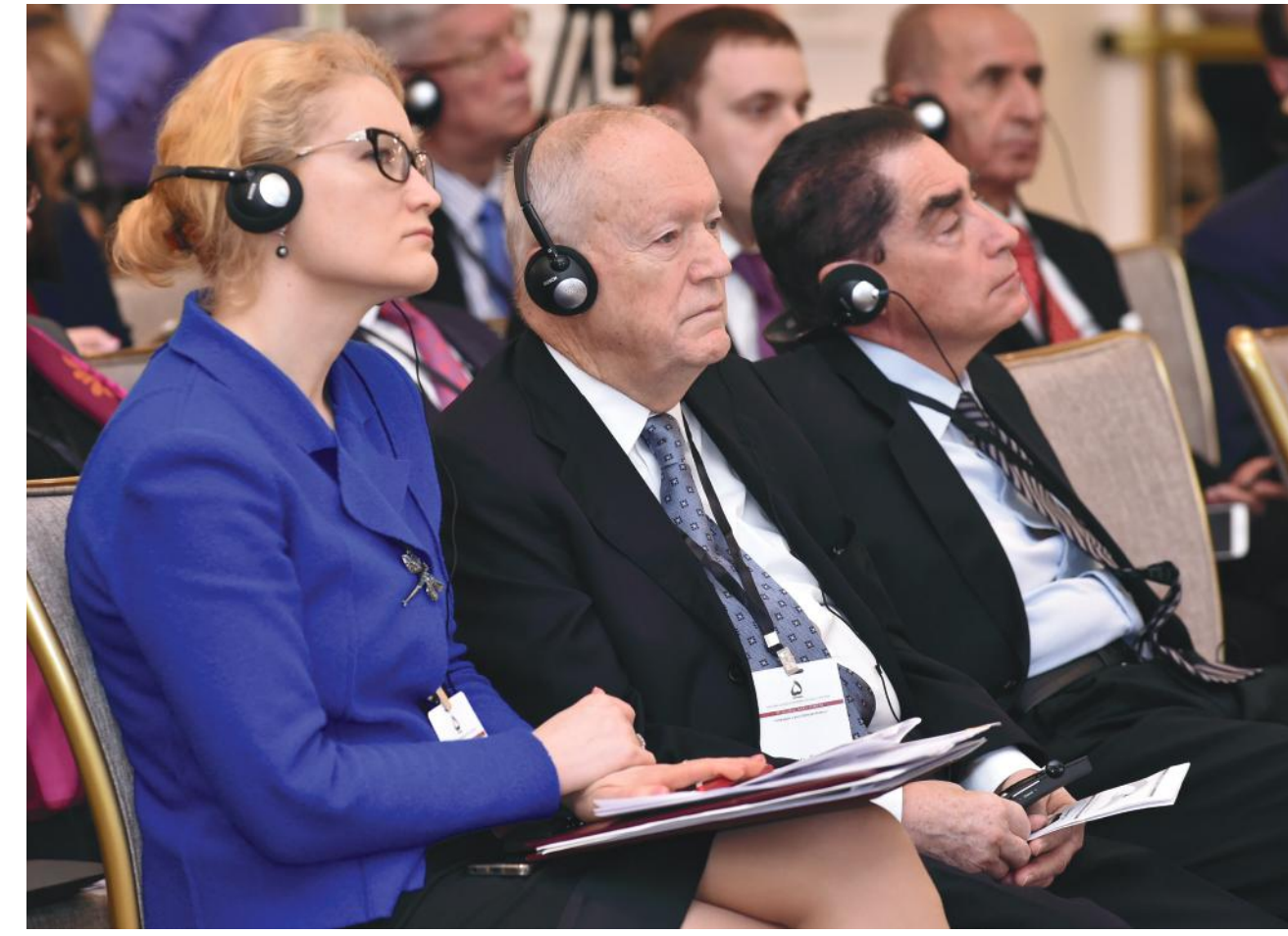
The delegates listen carefully, including former Romanian Prime Minister Petre Roman, right.