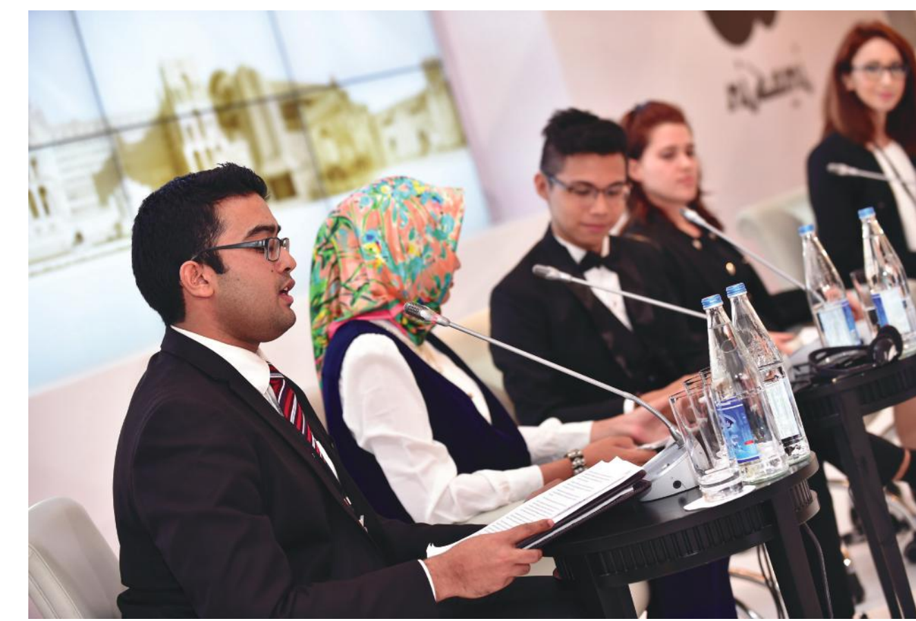
The Young Leaders discuss food security.

Echoing comments made elsewhere in the Baku Forum, the panel made it clear that realizing the untapped potential of local resources could play a key role in a sustainable future. This would mean engaging with farmers on land usage, as well as with indigenous peoples on the construction of dams and wind turbines. The efforts to reduce carbon emissions and secure the food supply will need to be inclusive and complementary, ensuring that a zero-sum game does not develop between the competing needs of agriculture, economic growth and the climate. Investing and training in green technologies, whilst allowing the private sector to pioneer reforms, could represent the means of blending progress and profit – to everyone's benefit.