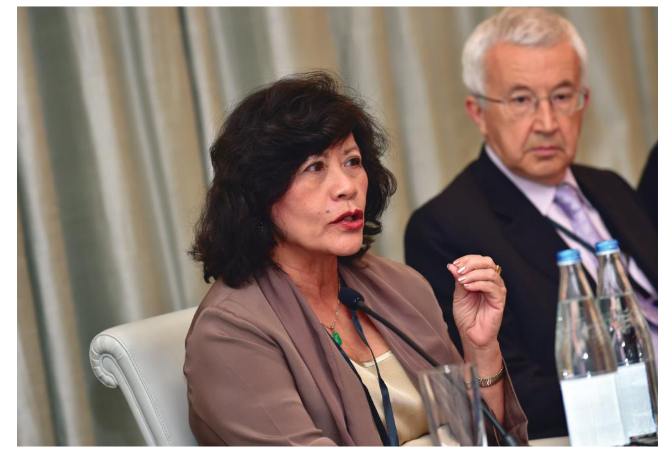
Noeleen Heyzer addresses the Forum on the subject of inequality.