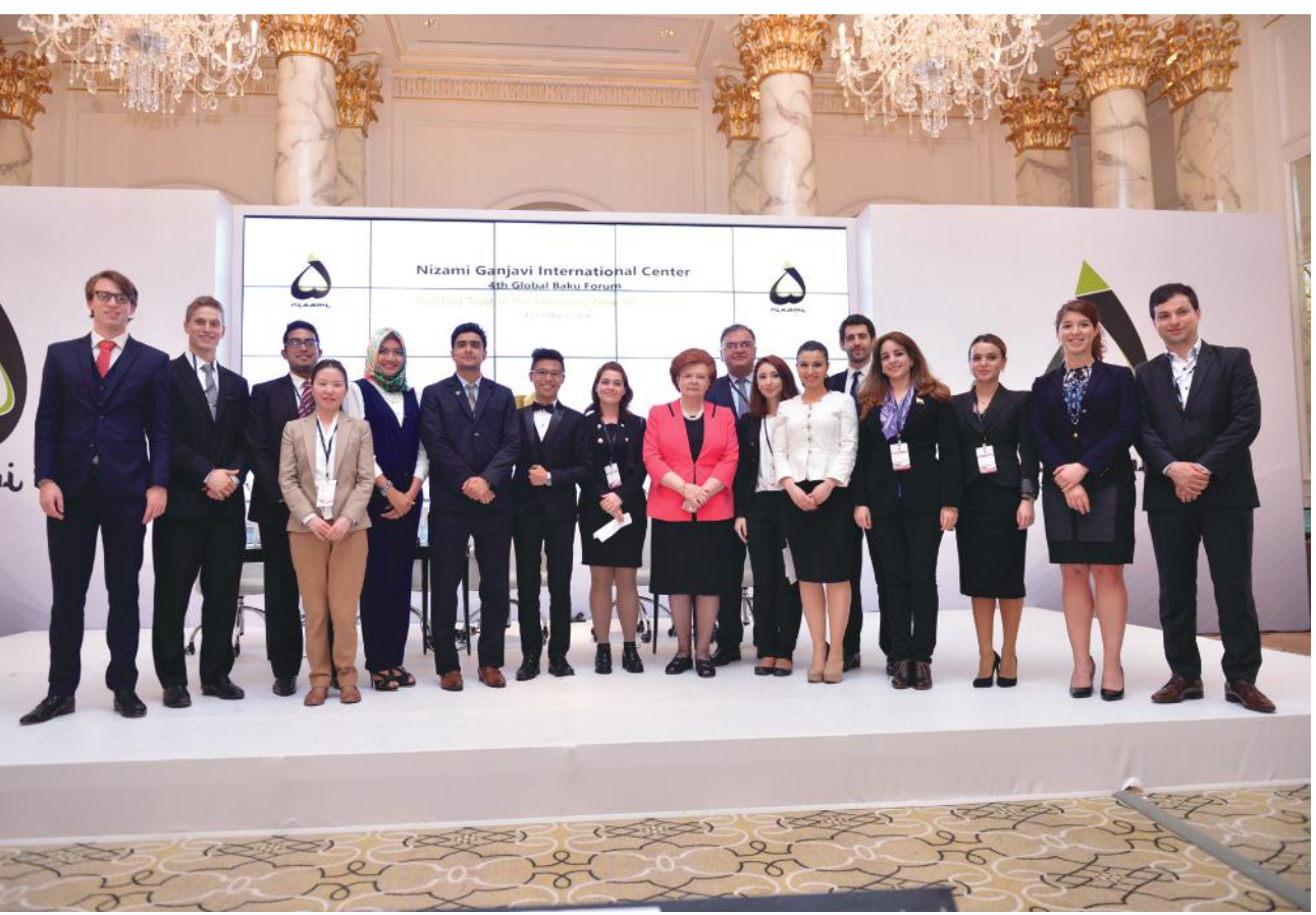
The Young Leaders of the 4th Global Baku Forum assembled with Vaira-Vike Freiberga.